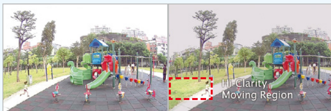
Without Smart Stream II